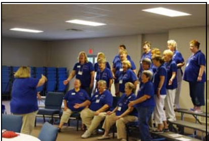
Spirit of Evansville