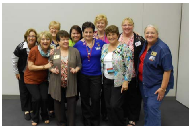
Members of both Region 4 and Region 23's RMT met briefly in Houston to discuss our exciting future.

The Region 4 Regional Management Team met with the four members of the Region 23 Regional Management Team who will be coming to Region 4. We all are looking forward to creating a great region.