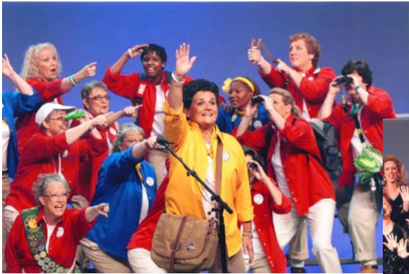
Metro Nashville Chorus

Well deserved kudos and "pats on the back" to everyone... all the way around. Is it any wonder we're proud?